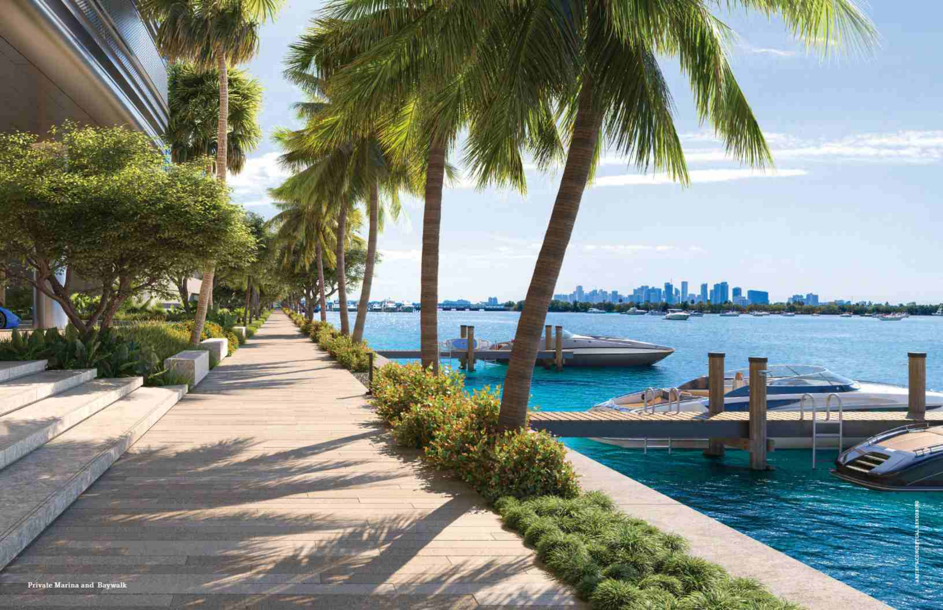
Private Marina and Baywalk