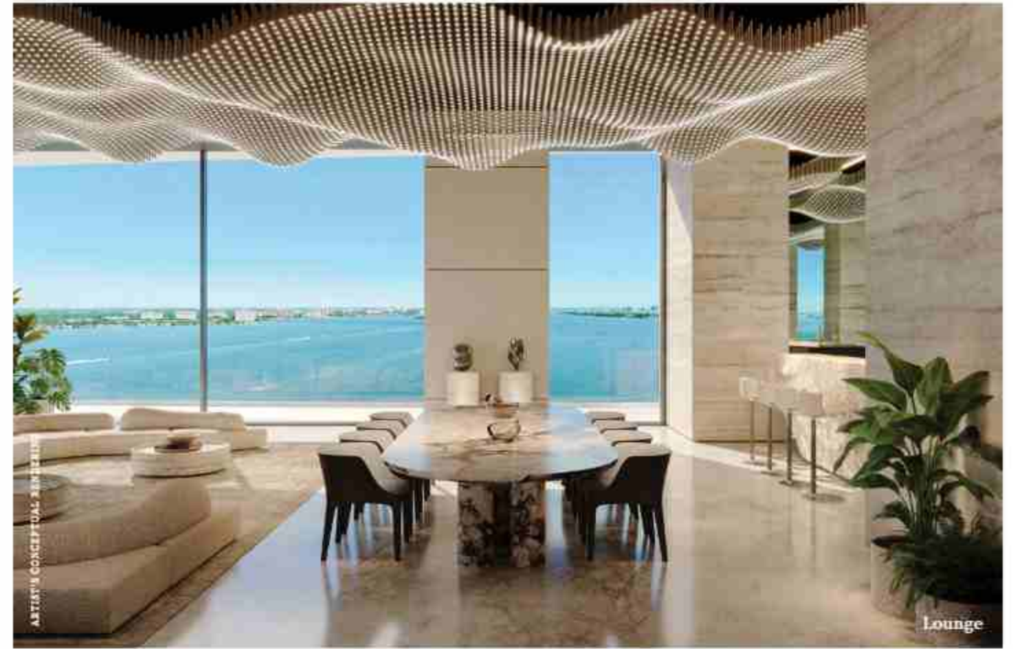
PAGANI RESIDENCES 19: NORTH BAY VILLAGE