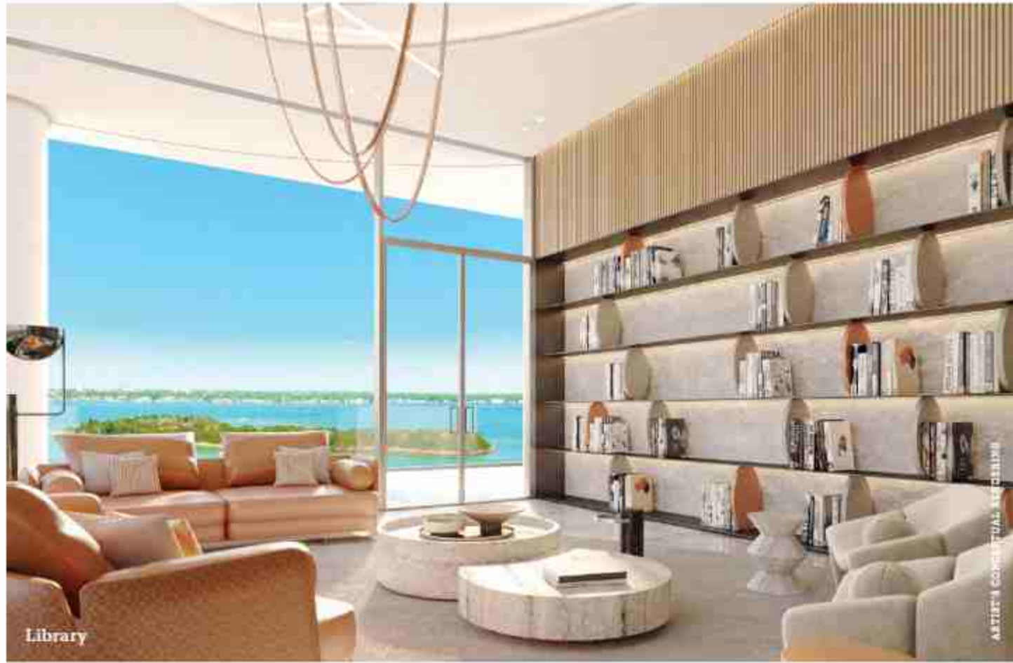
PAGANI RESIDENCES 18: NORTH BAY VILLAGE