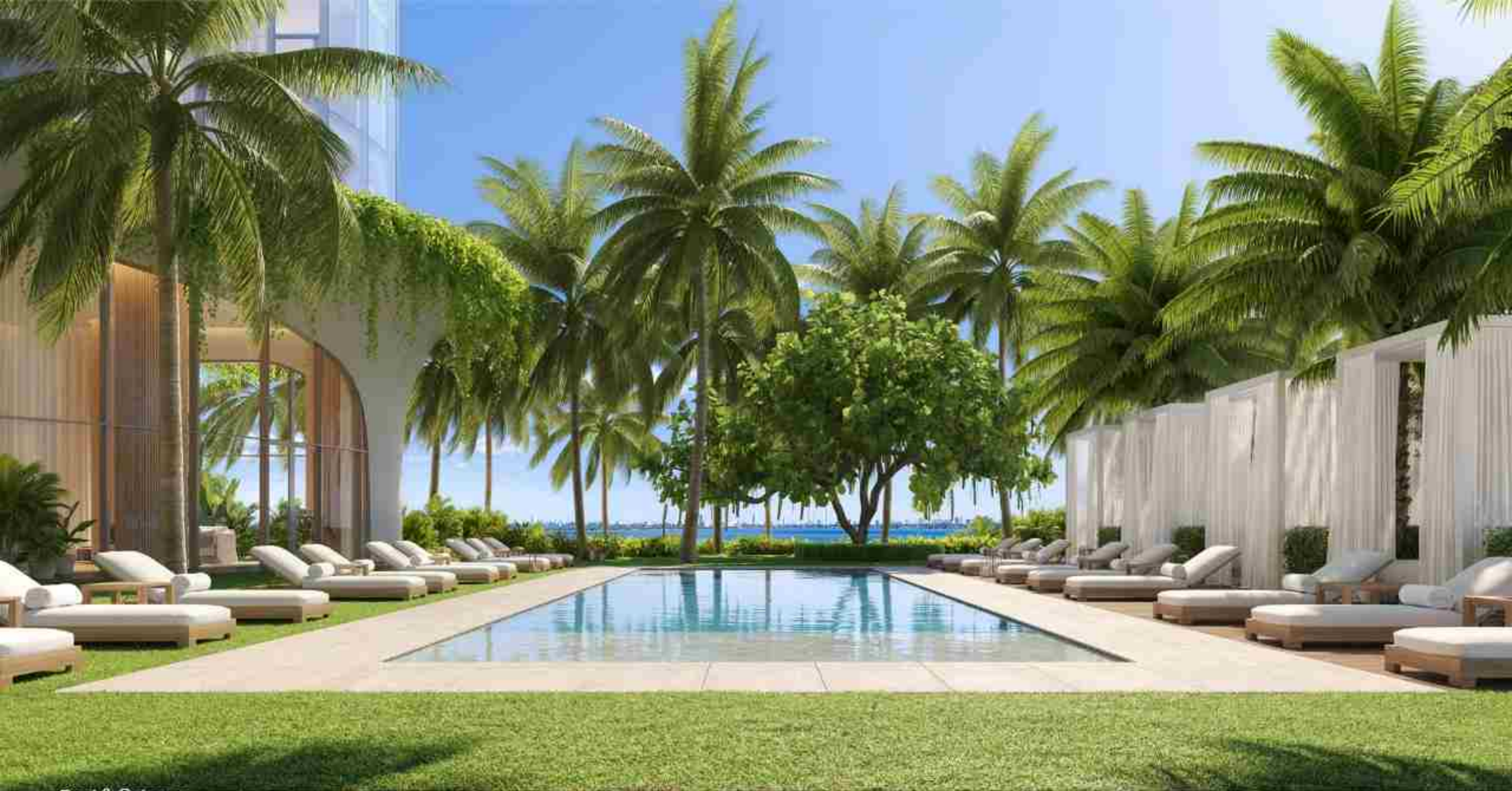
Pool & Cabanas