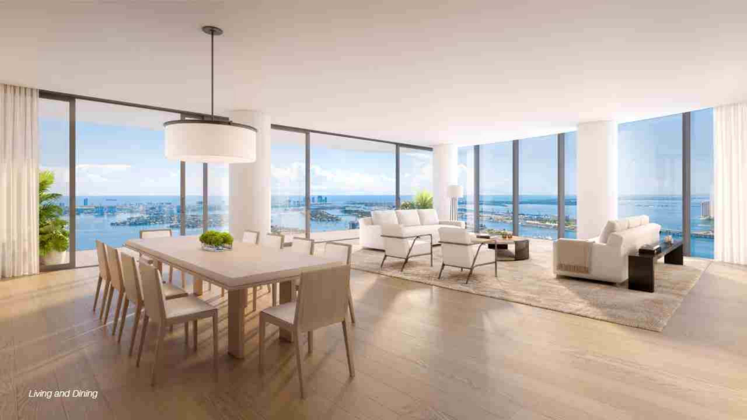
Living and Dining