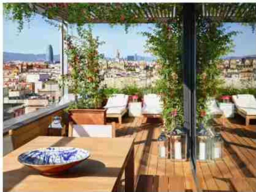
Above: The Barcelona EDITION Right: The Miami Beach EDITION

EDITION HOTELS ARE STUNNING MICROCOSMS OF THE WORLD'S TOP CITIES FEATURING THE BEST IN SERVICE, FOOD, BEVERAGE AND ENTERTAINMENT.