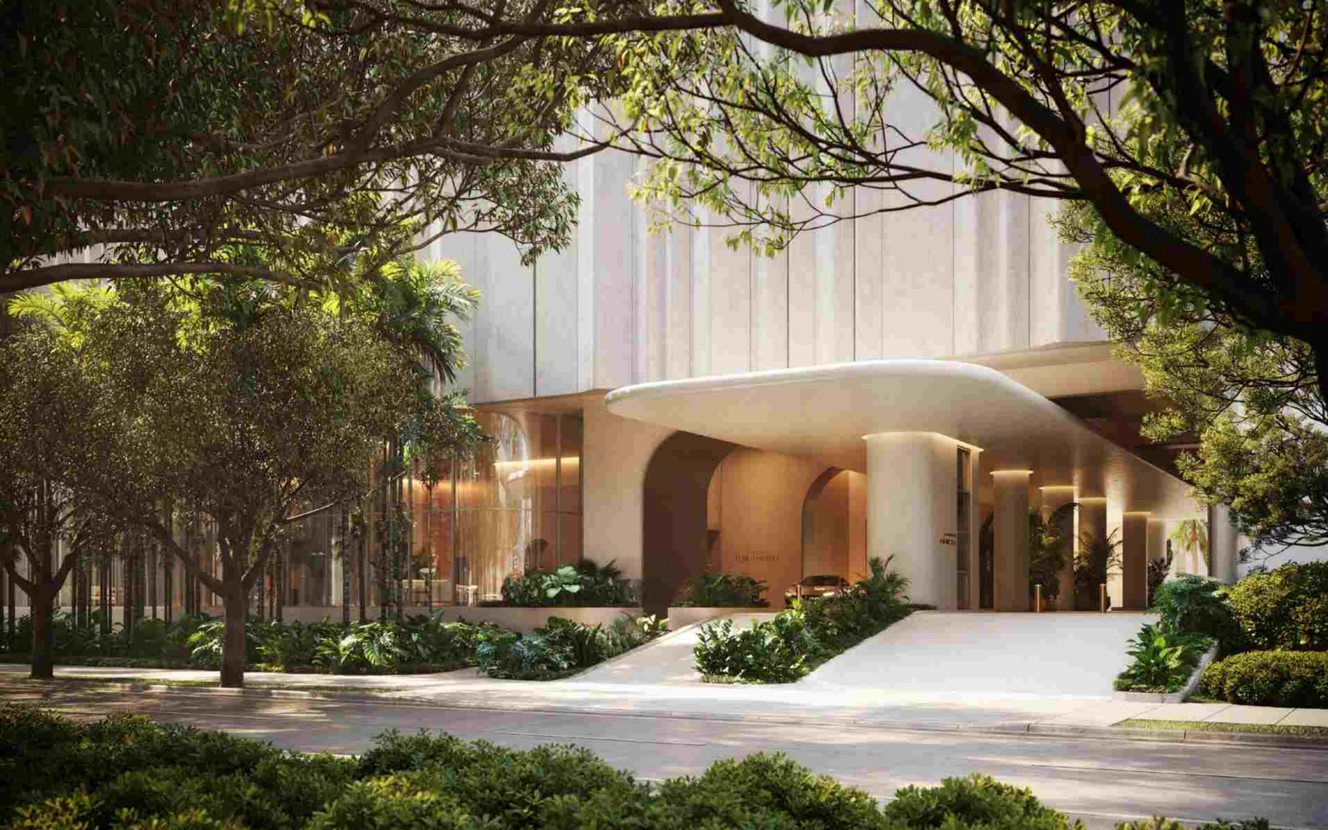
The Building's Guarded Entrance Features A Lush, Tropical Garden And An Impressive Porte-Cochere