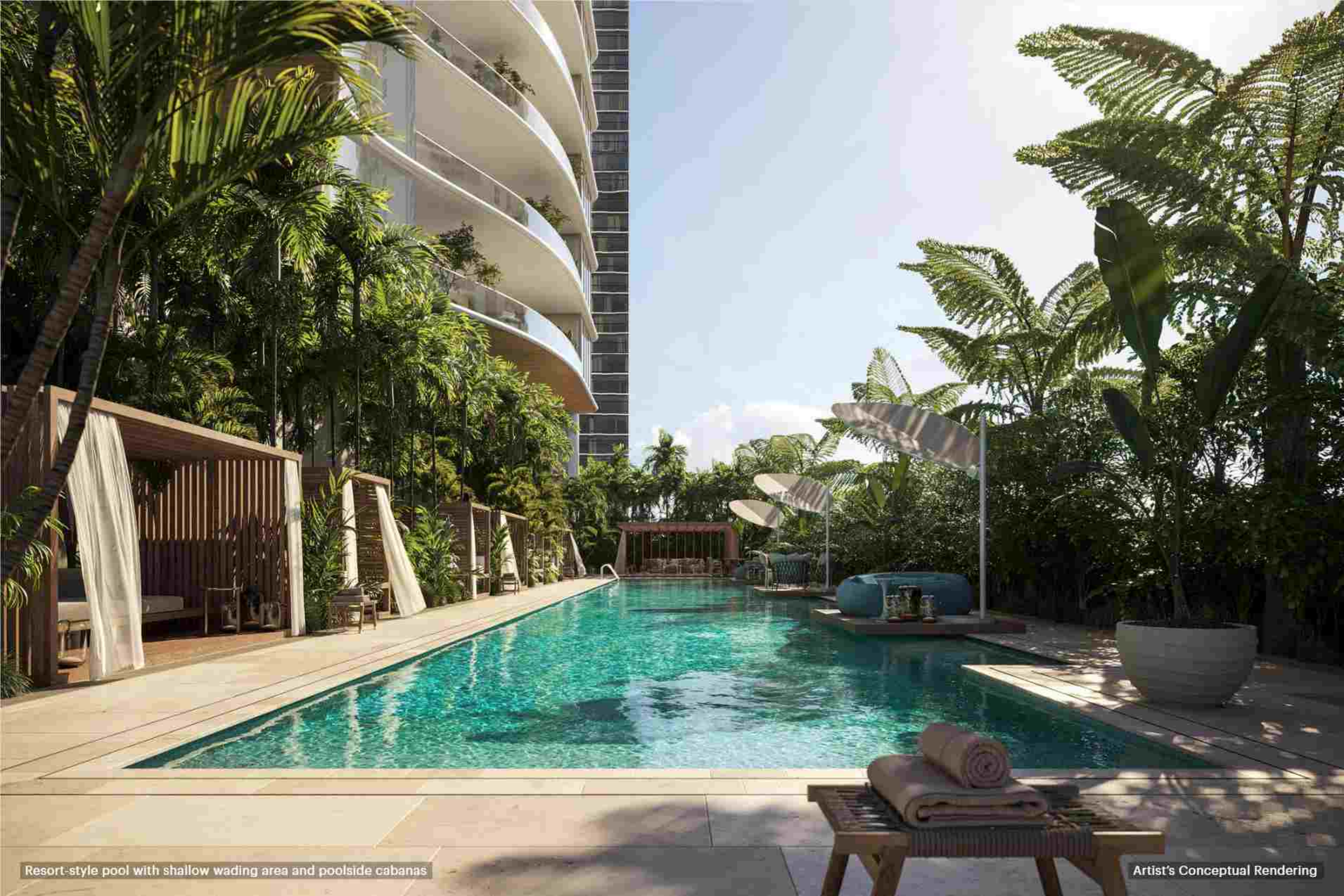
Resort-style pool with shallow wading area and poolside cabanas