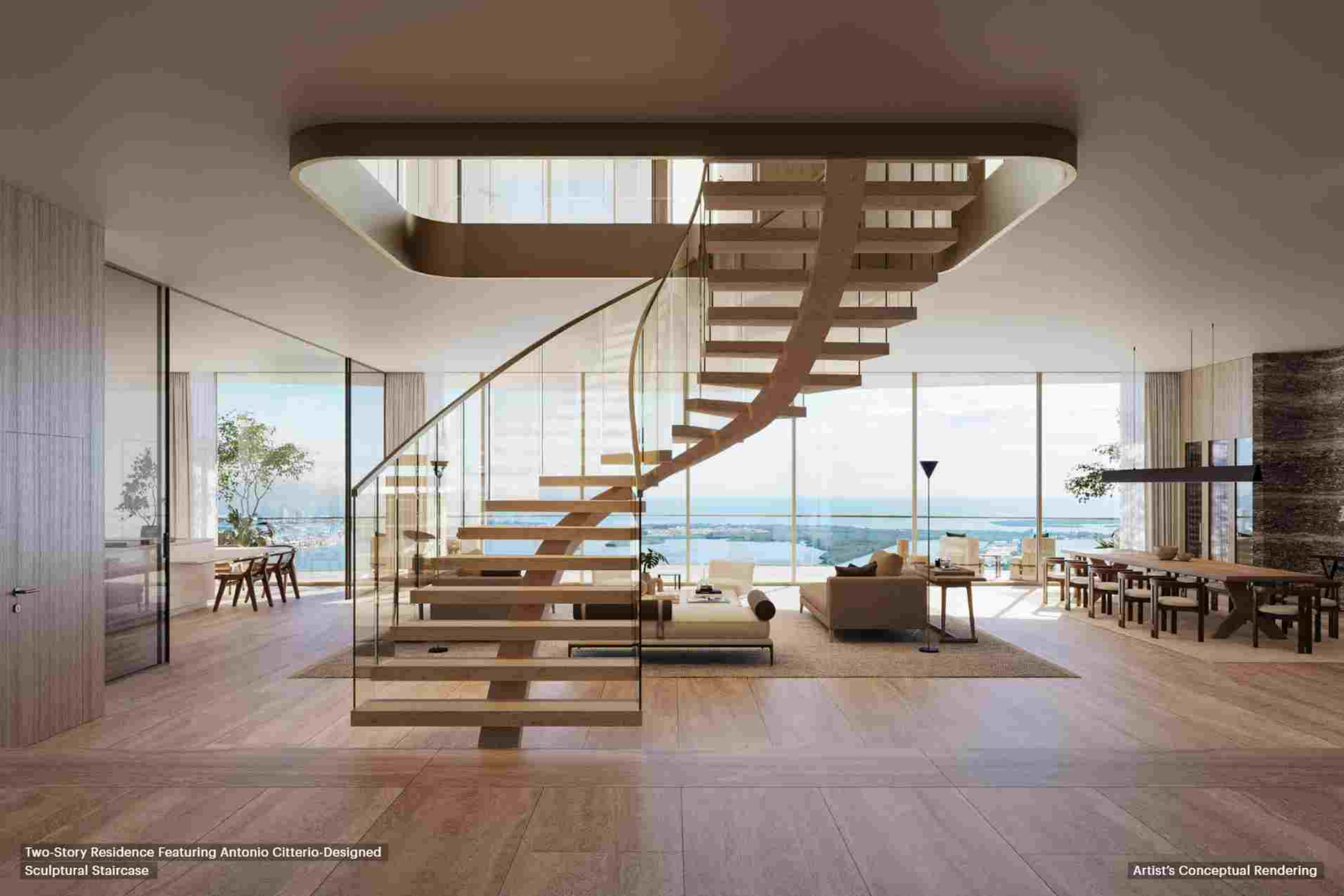
Two-Story Residence Featuring Antonio Citterio-Designed Sculptural Staircase