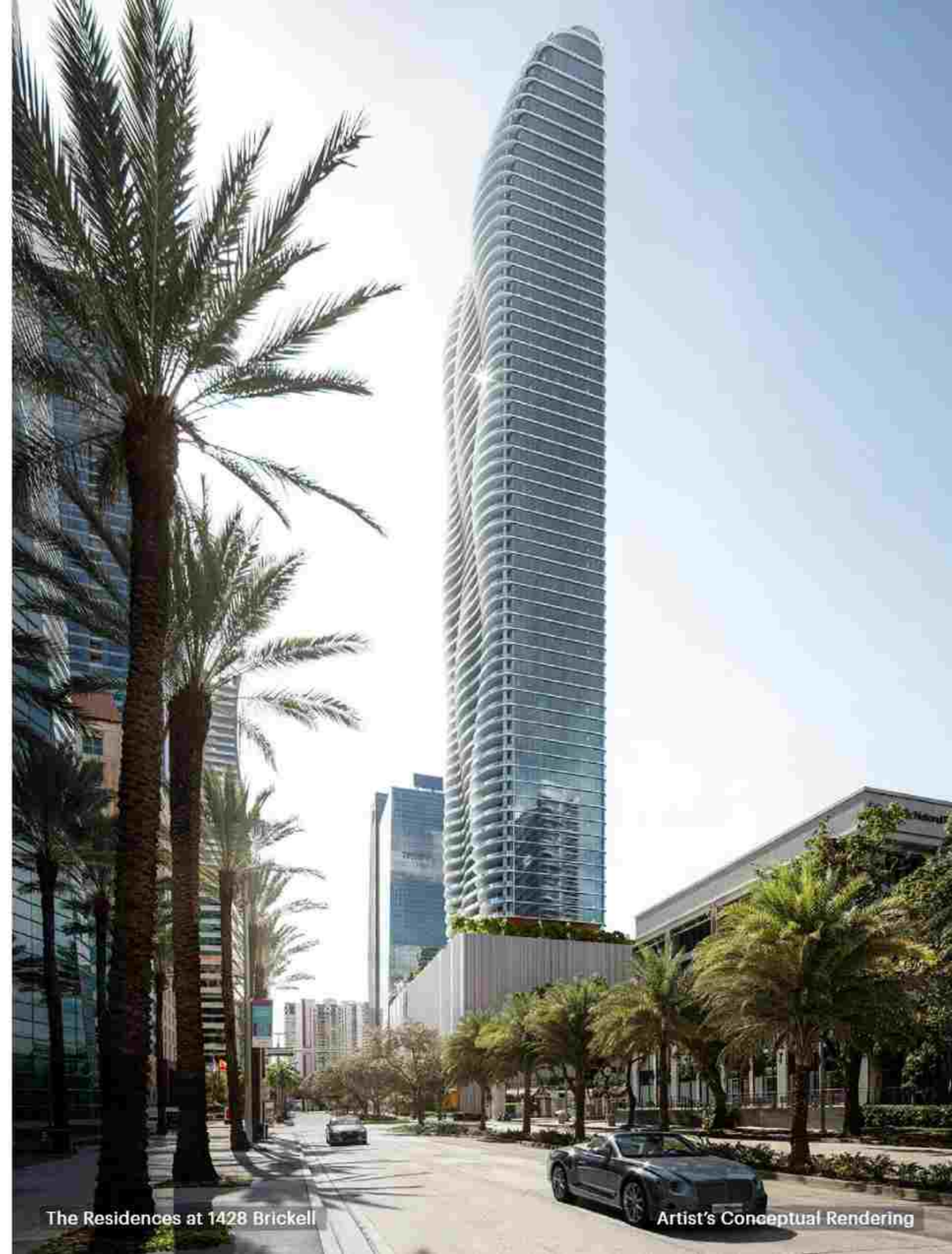
The Residences at 1428 Brickell