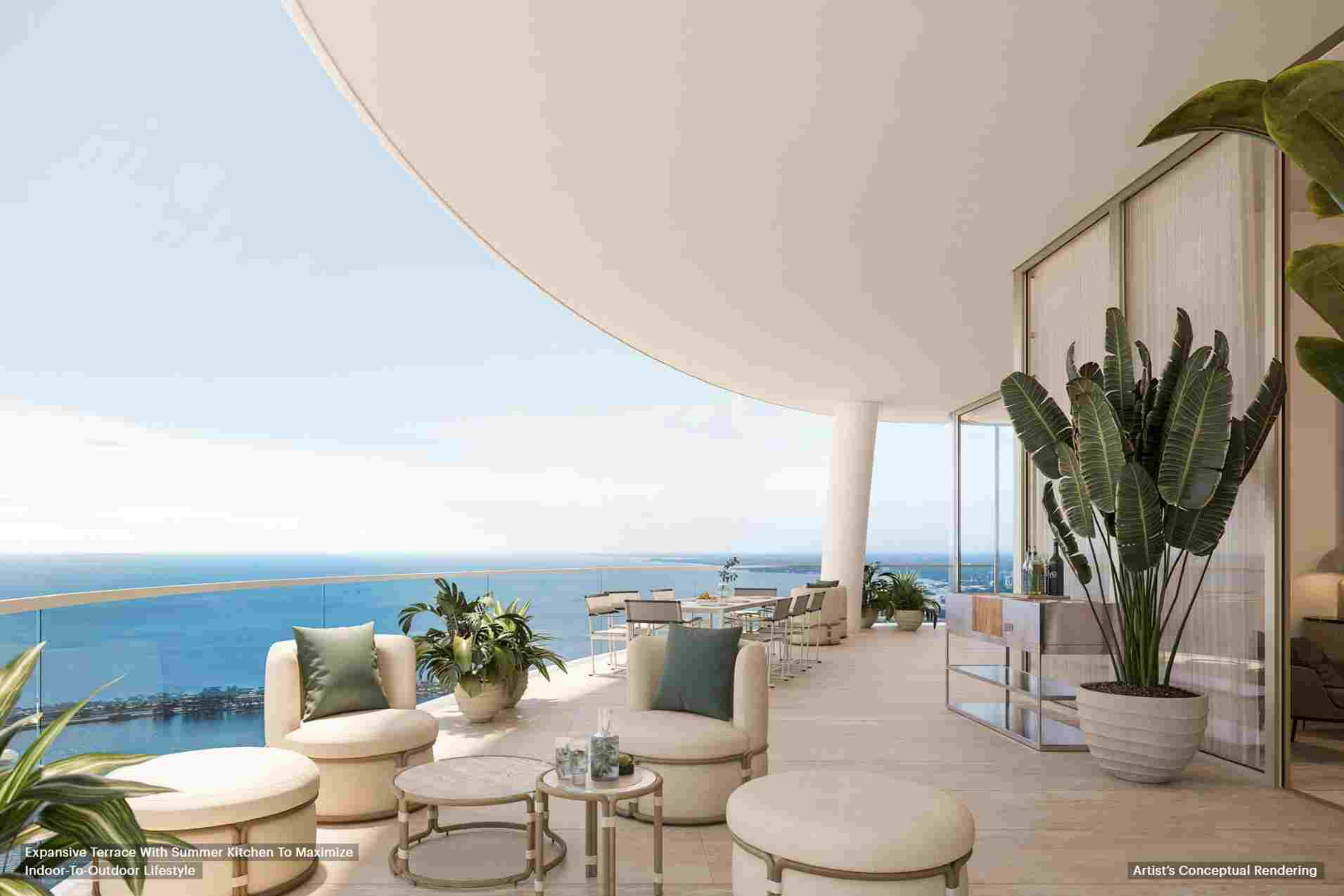
Expansive Terrace With Summer Kitchen To Maximize Indoor-To-Outdoor Lifestyle