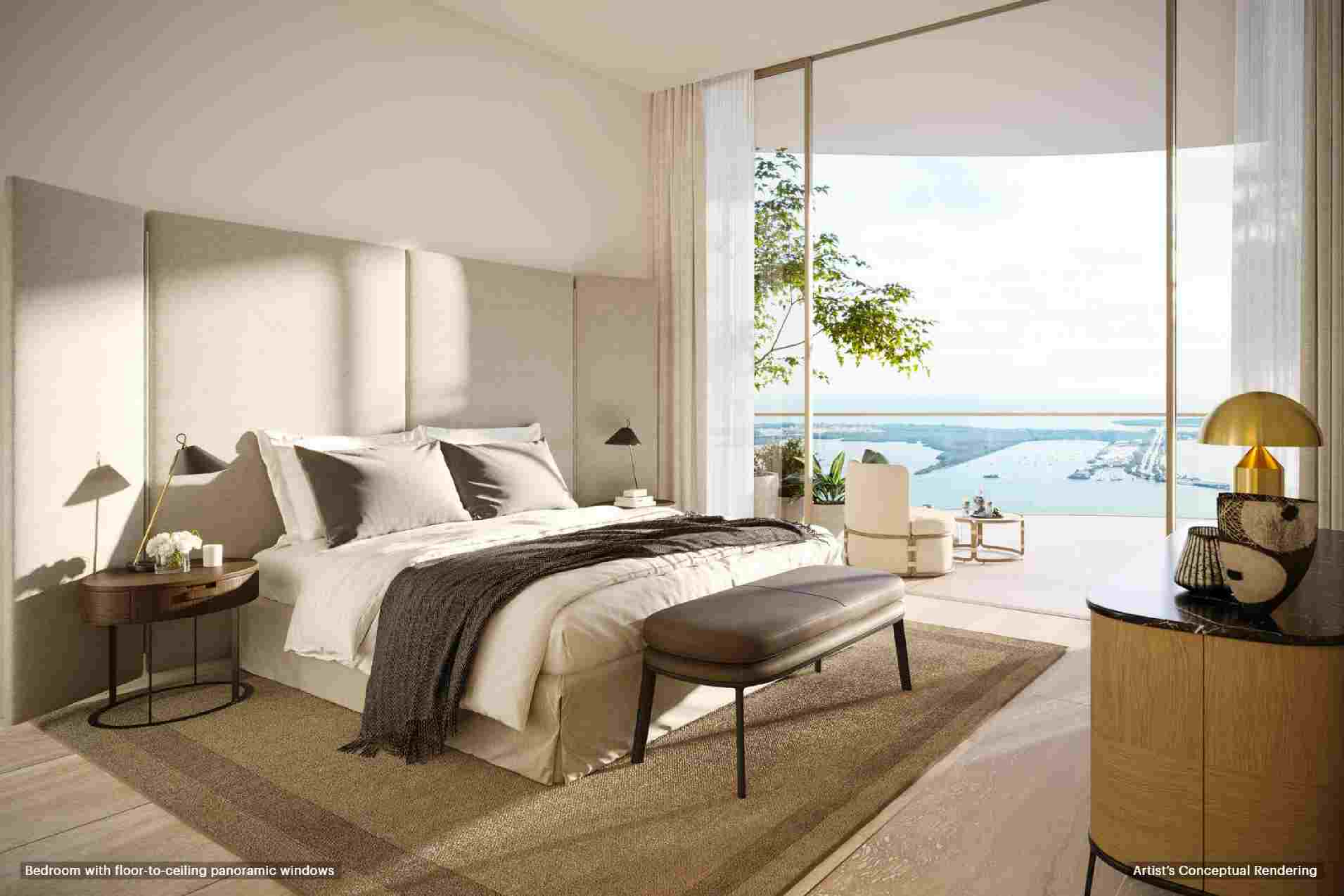
Bedroom with floor-to-ceiling panoramic windows