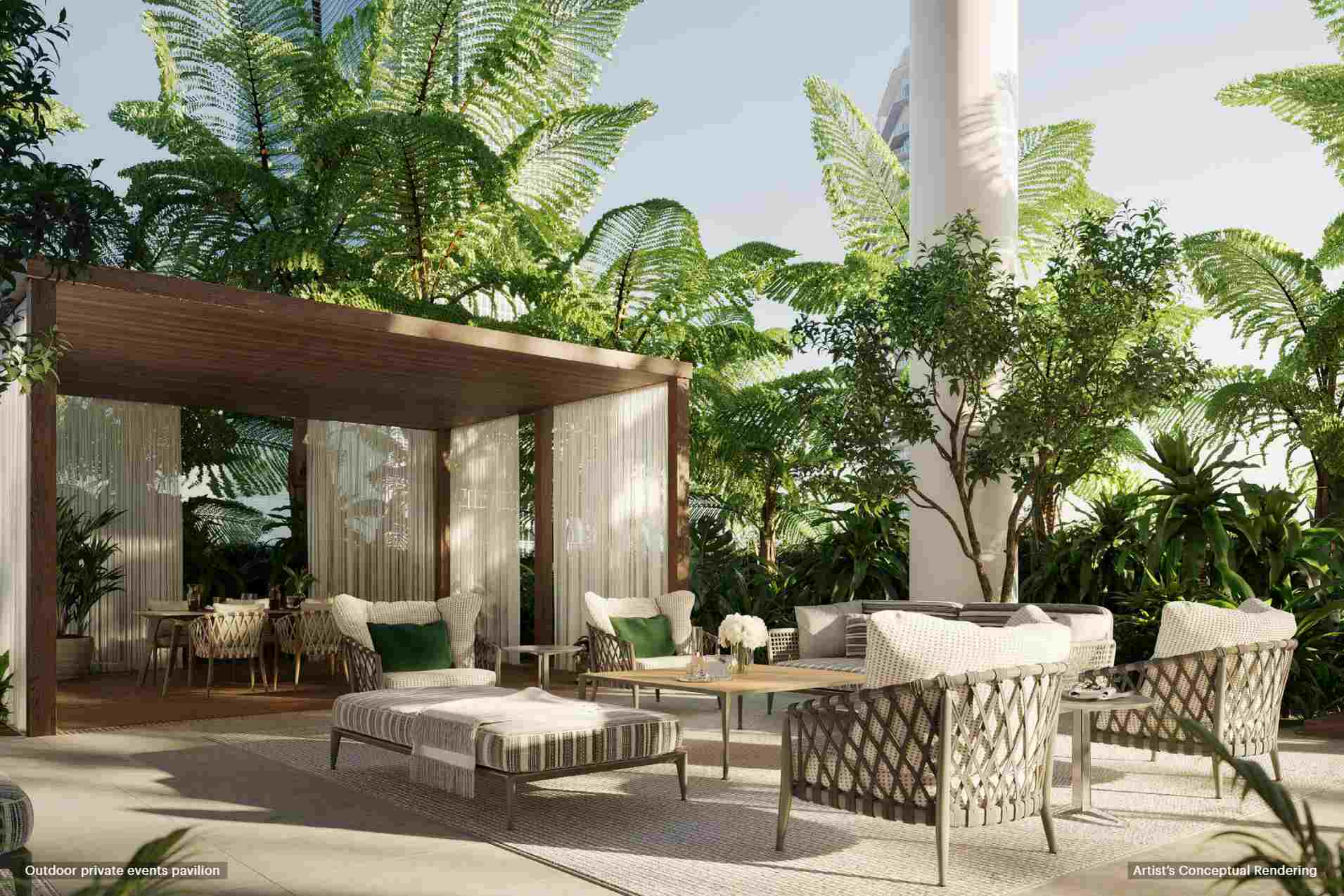
Outdoor private events pavilion