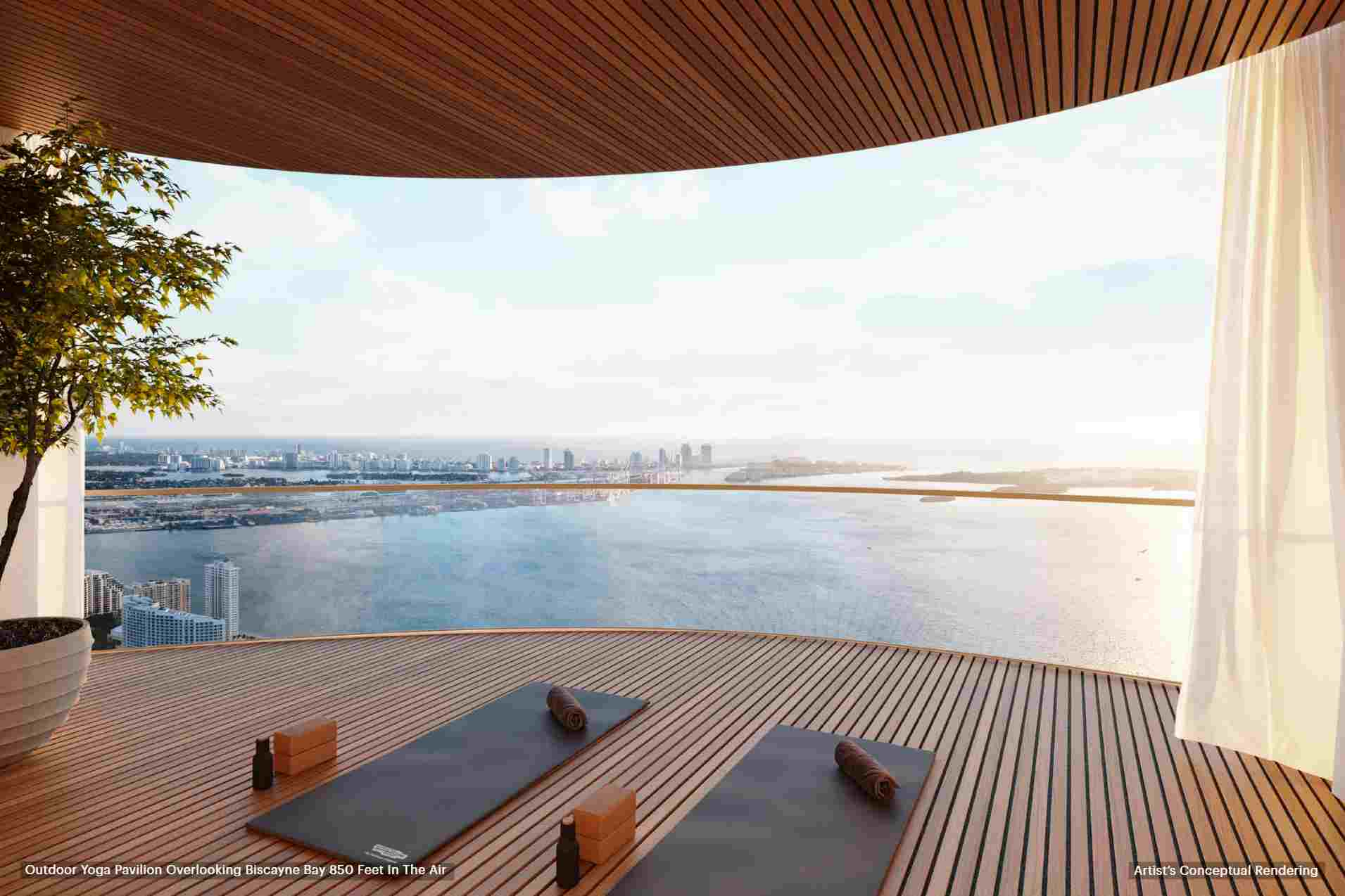
Outdoor Yoga Pavilion Overlooking Biscayne Bay 850 Feet In The Air