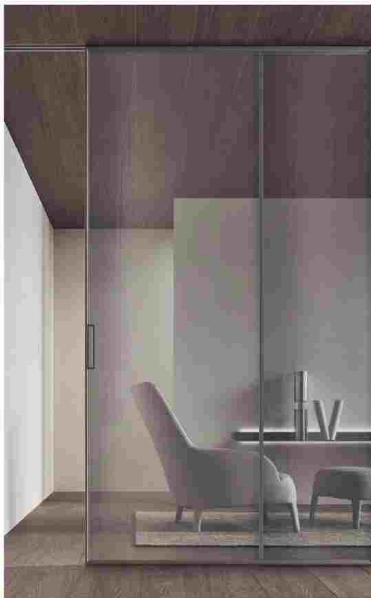
RIMADESIO Glass Enclosures