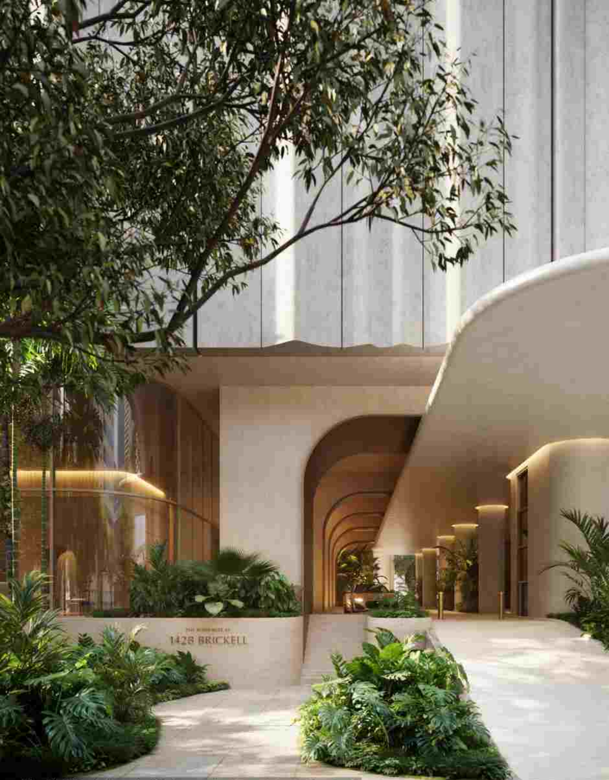
The Building's Guarded Entrance Features A Lush, Tropical Garden And An Impressive Porte-Cochere