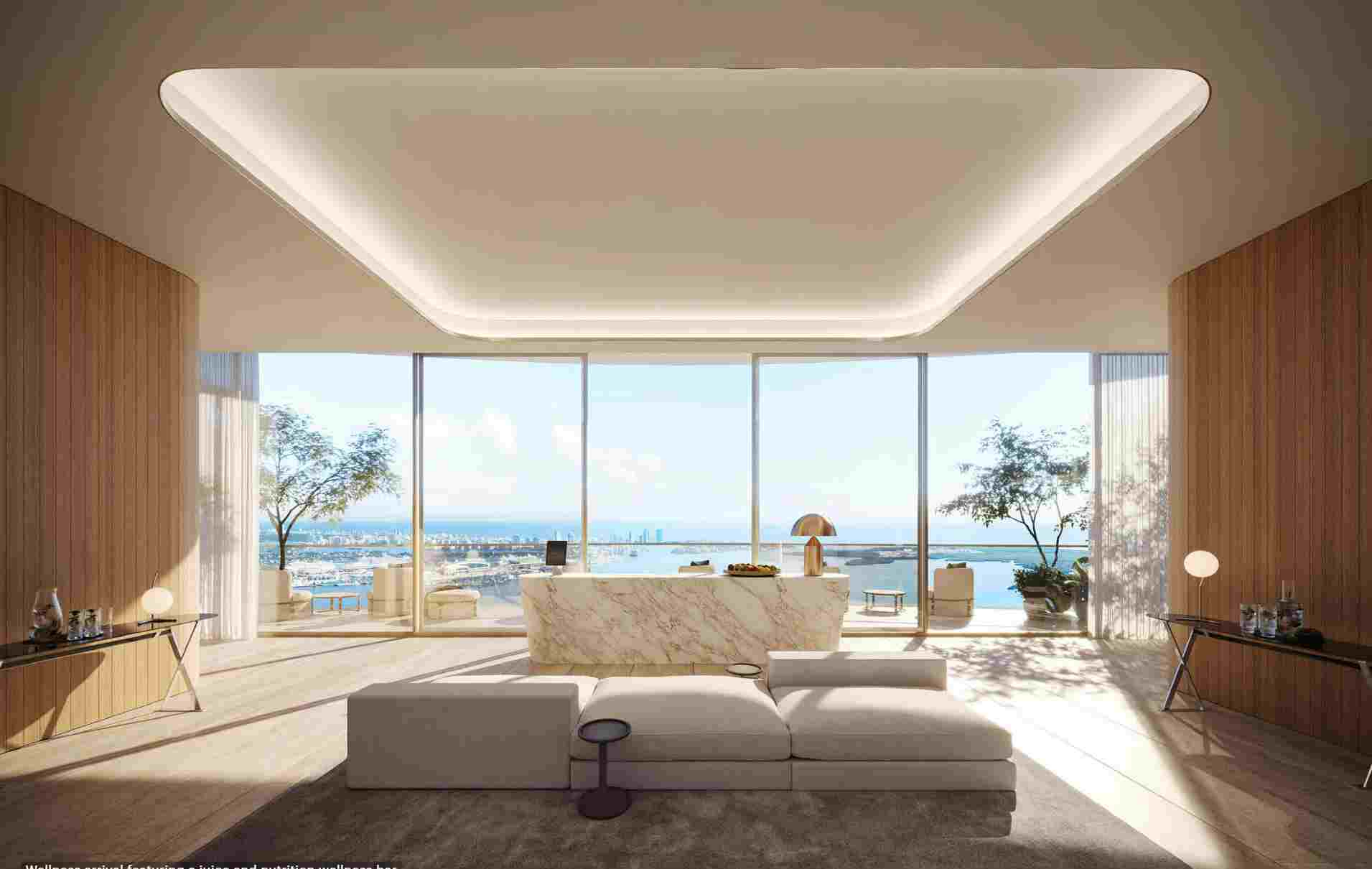
Wellness arrival featuring a juice and nutrition wellness bar for healthy post-workout food and beverages