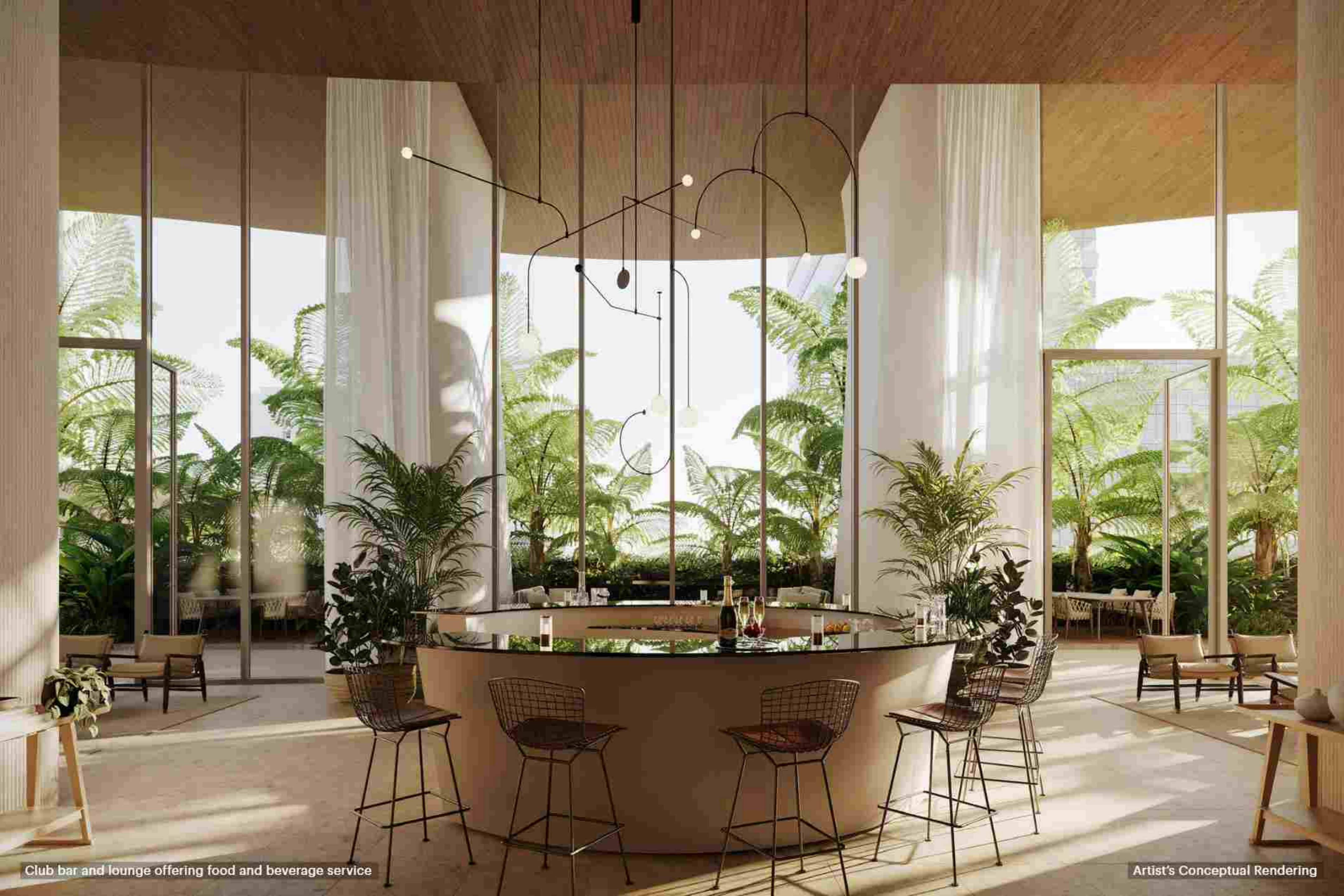
Club bar and lounge offering food and beverage service