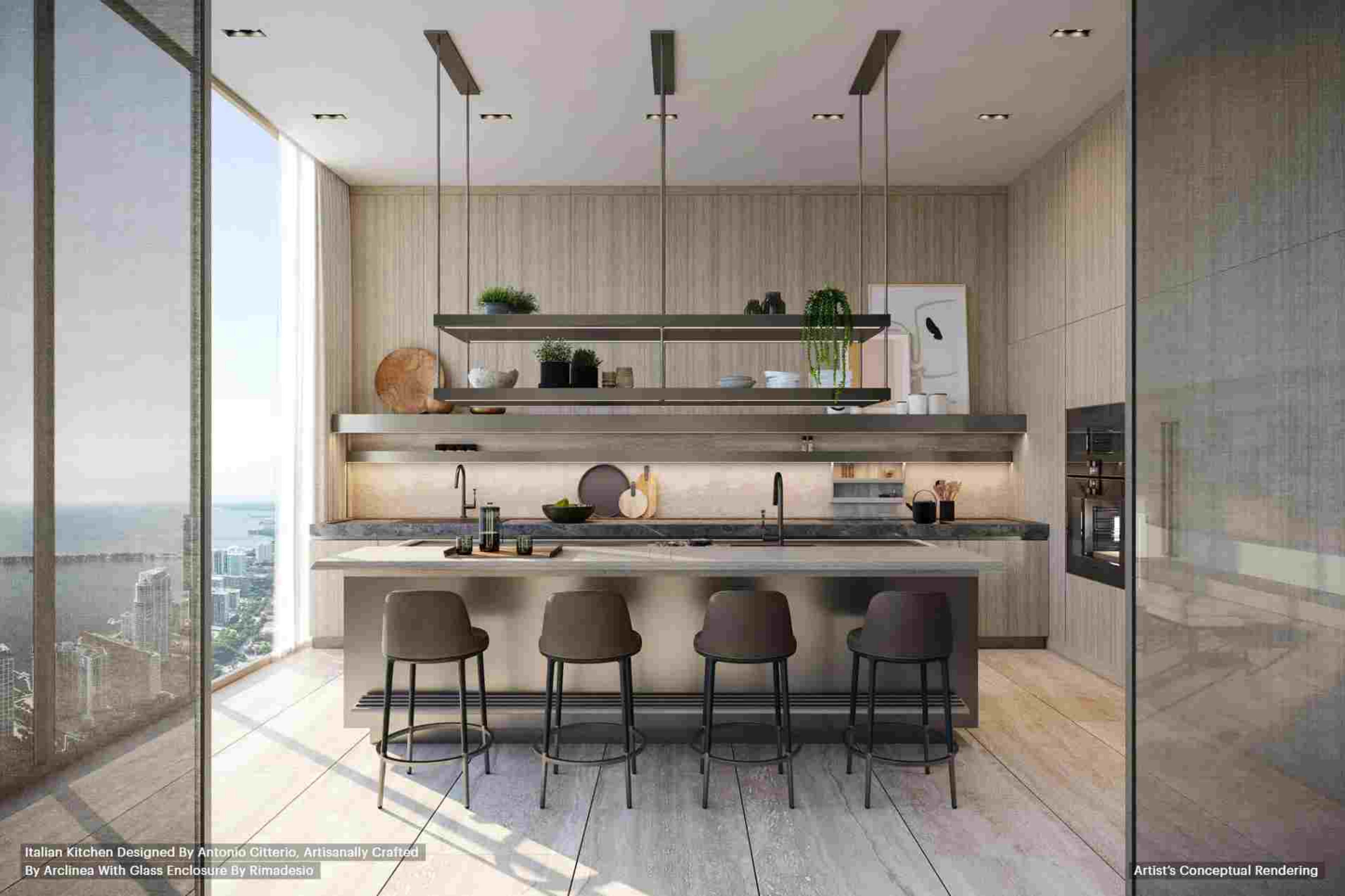
Italian Kitchen Designed By Antonio Citterio, Artisanally Crafted By Arclinea With Glass Enclosure By Rimadesio