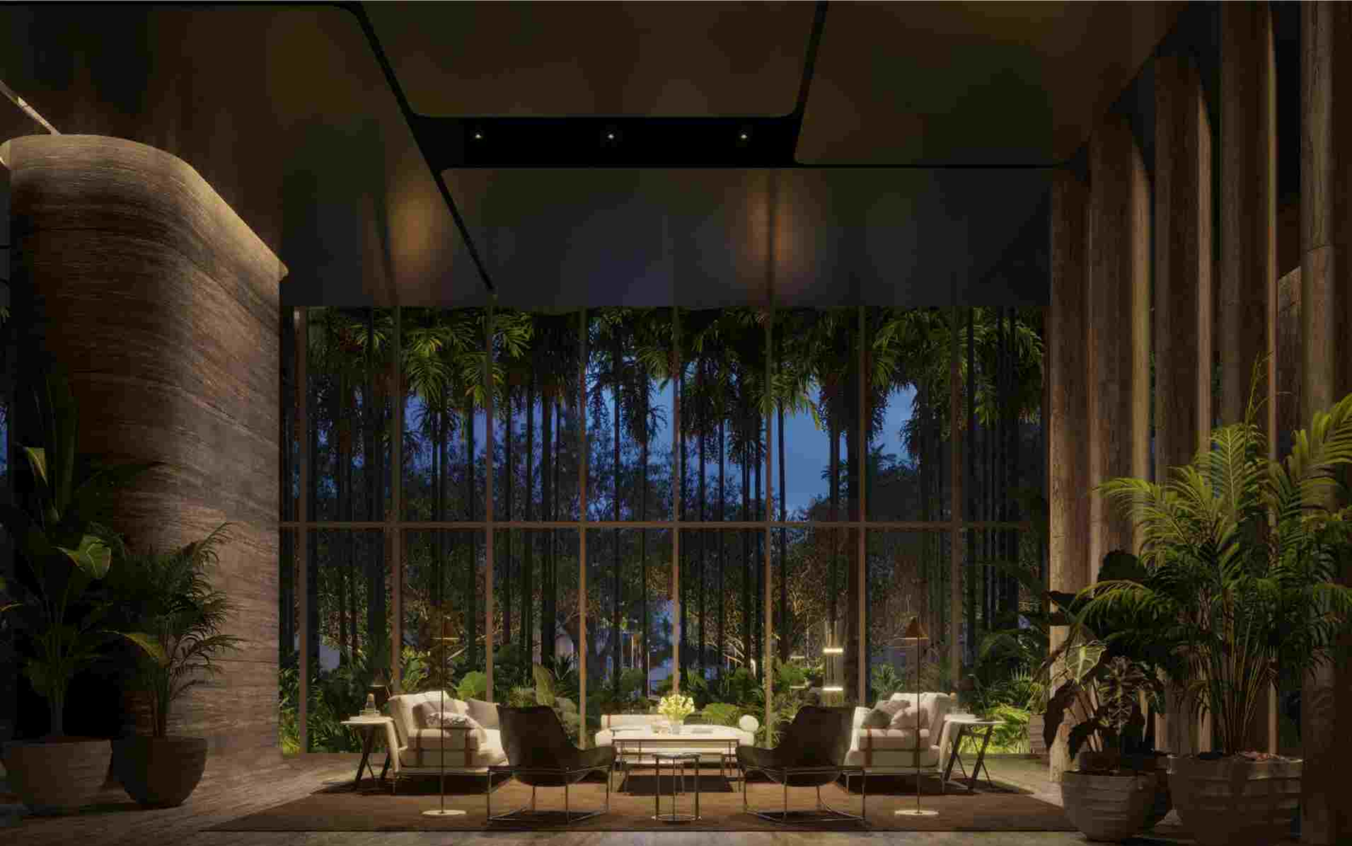
Residents And Guests Enter Through A Stunning Lobby With A Series Of Unique Spaces Including A Library Lounge And Aperitivo Bar