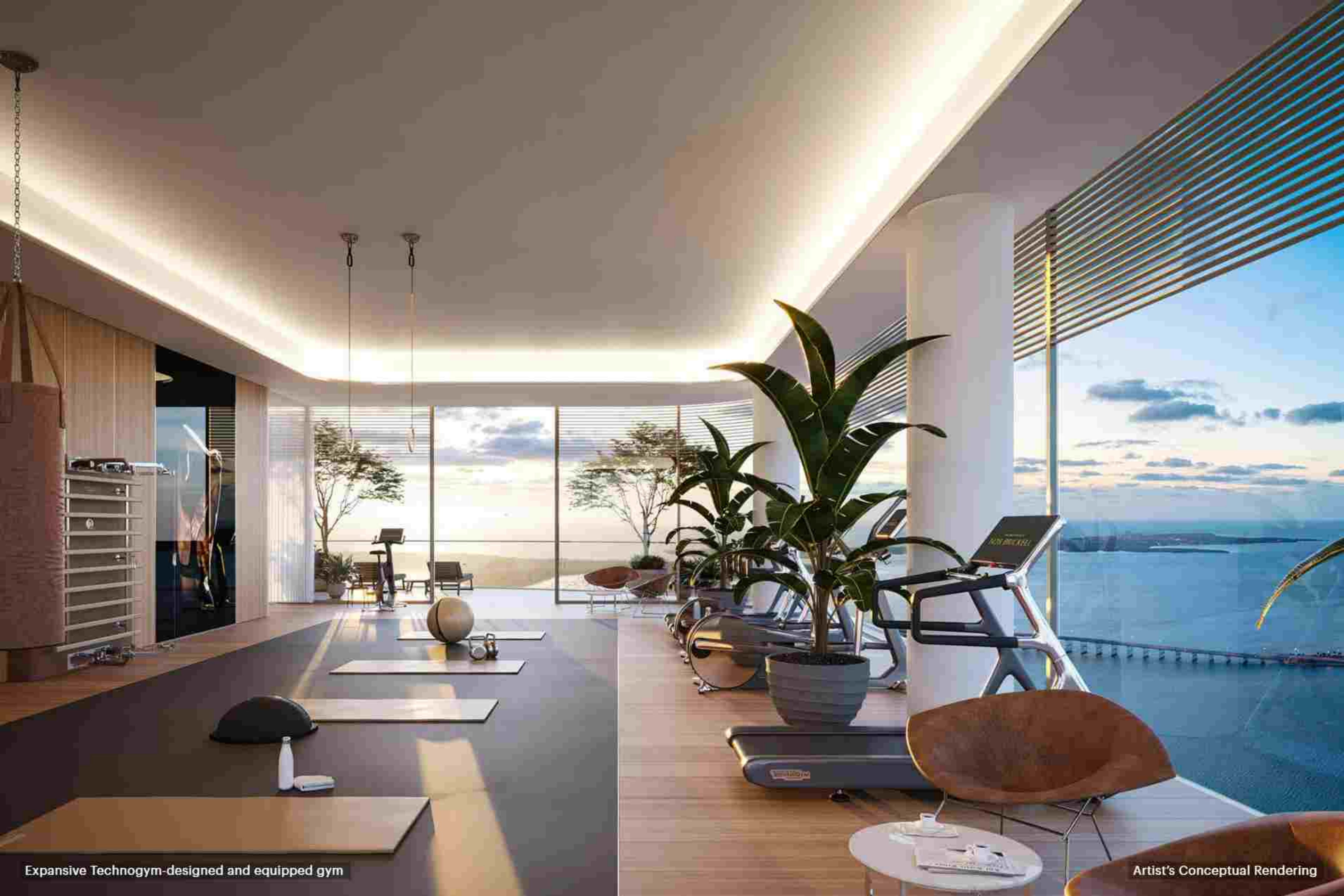
Expansive Technogym-designed and equipped gym