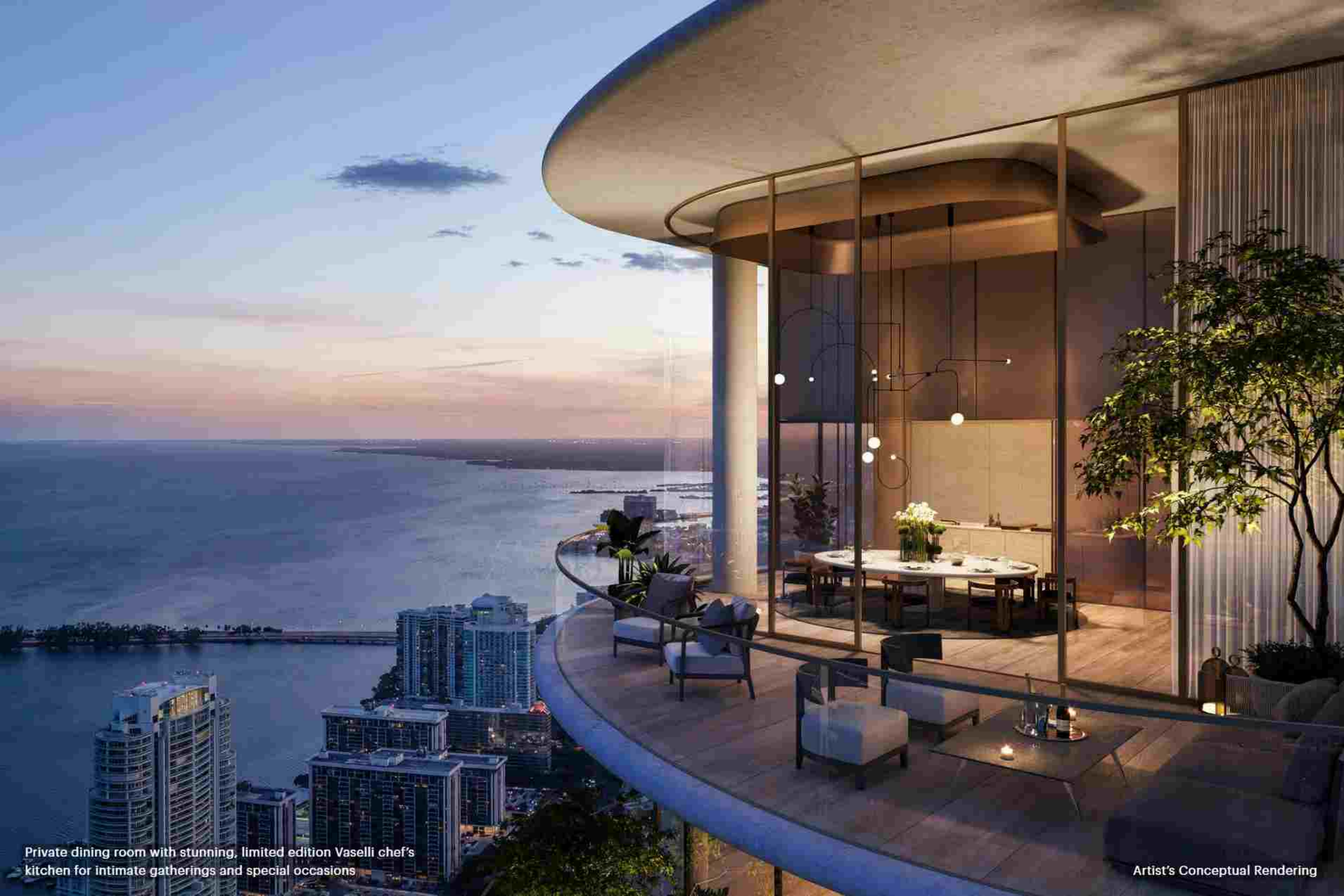
Private dining room with stunning, limited edition Vaselli chef's kitchen for intimate gatherings and special occasions