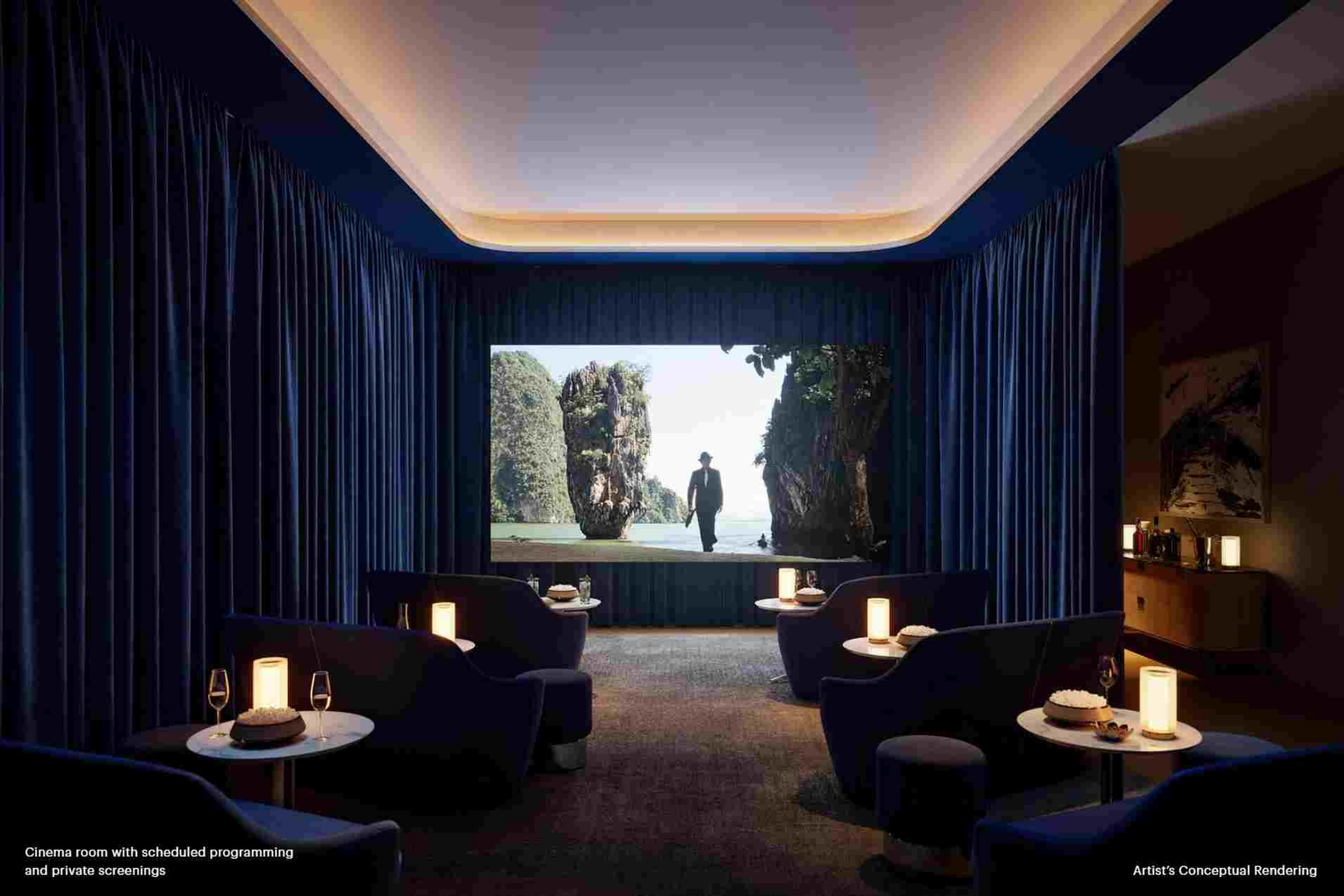
Cinema room with scheduled programming and private screenings