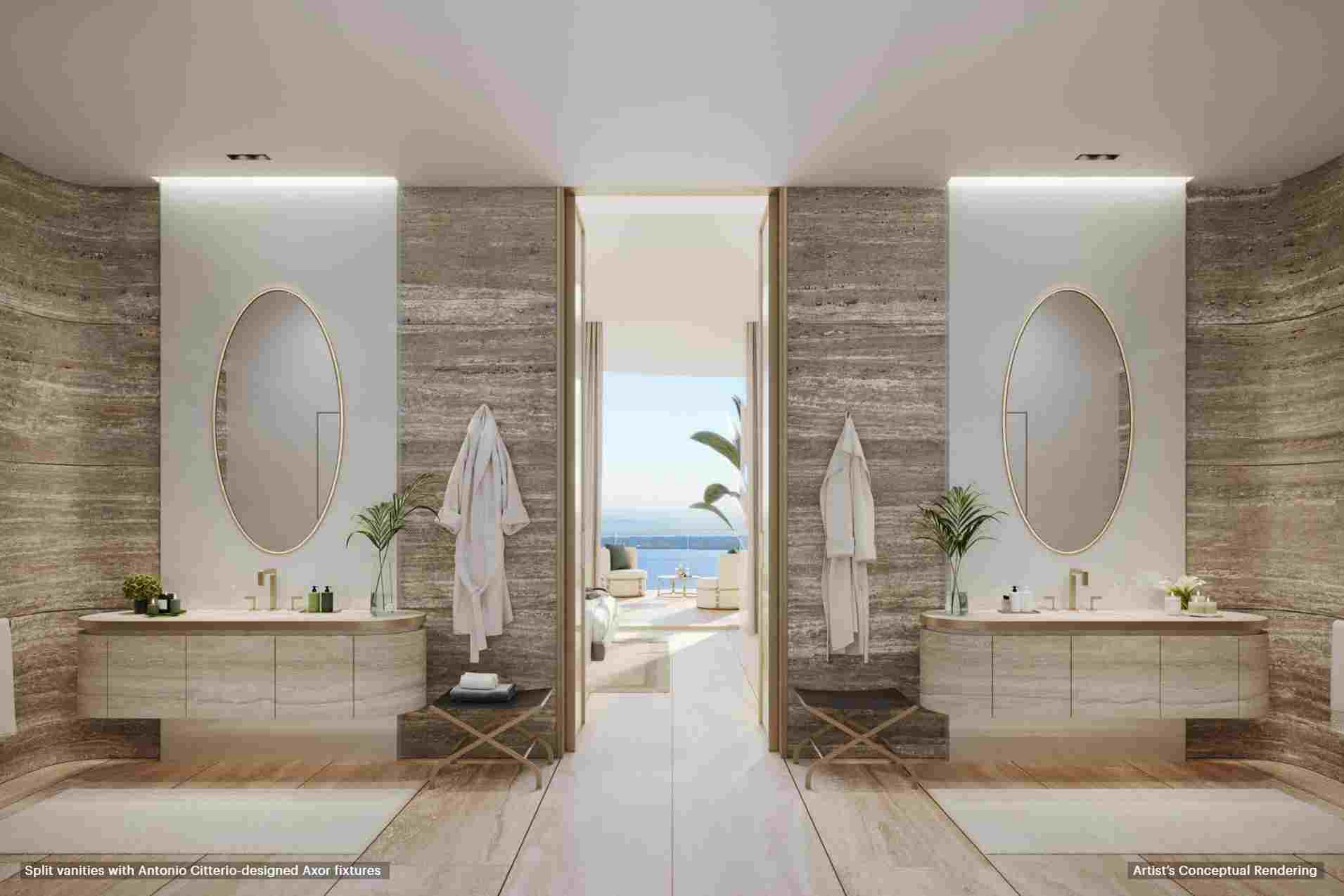
Split vanities with Antonio Citterio-designed Axor fixtures