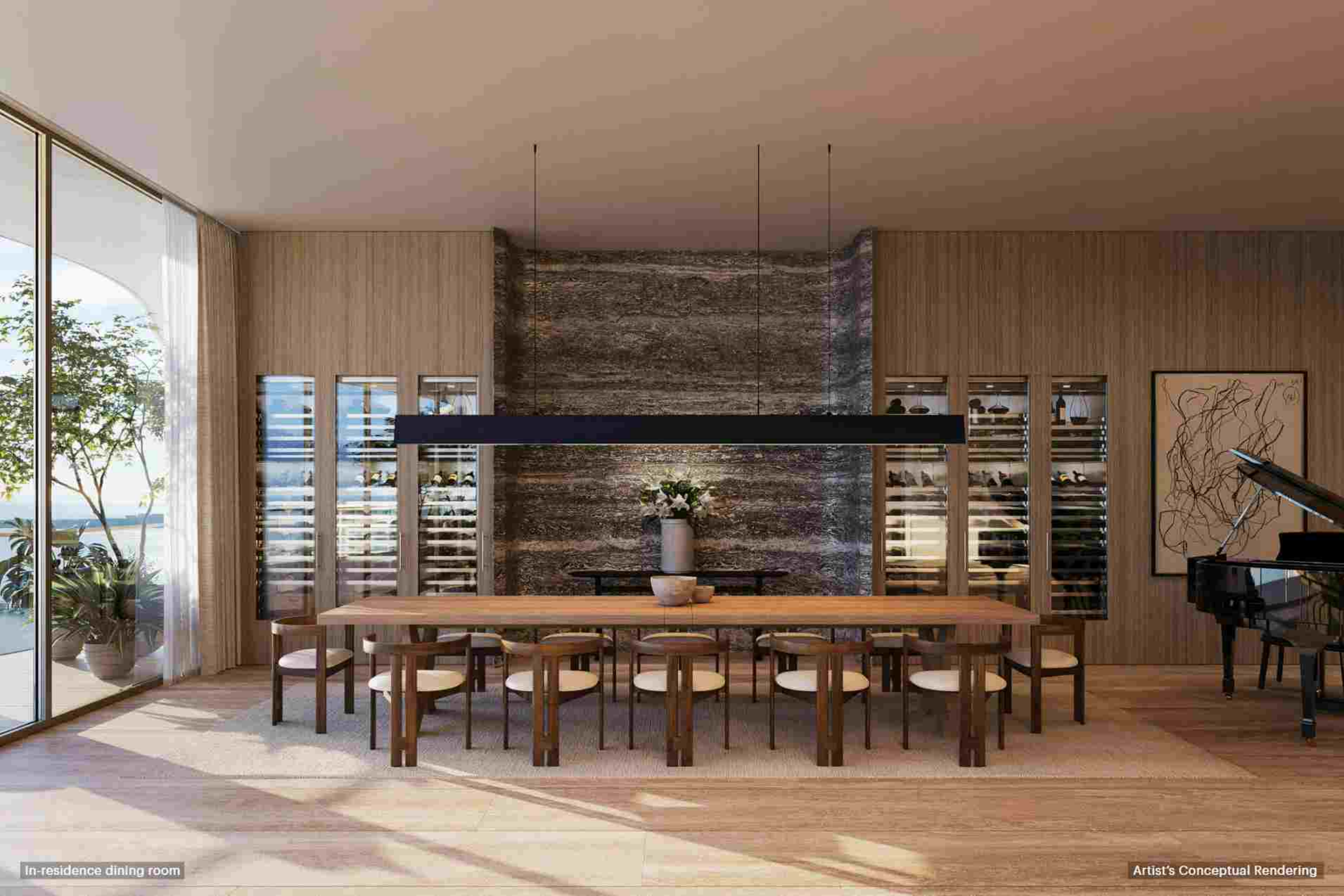
In-residence dining room