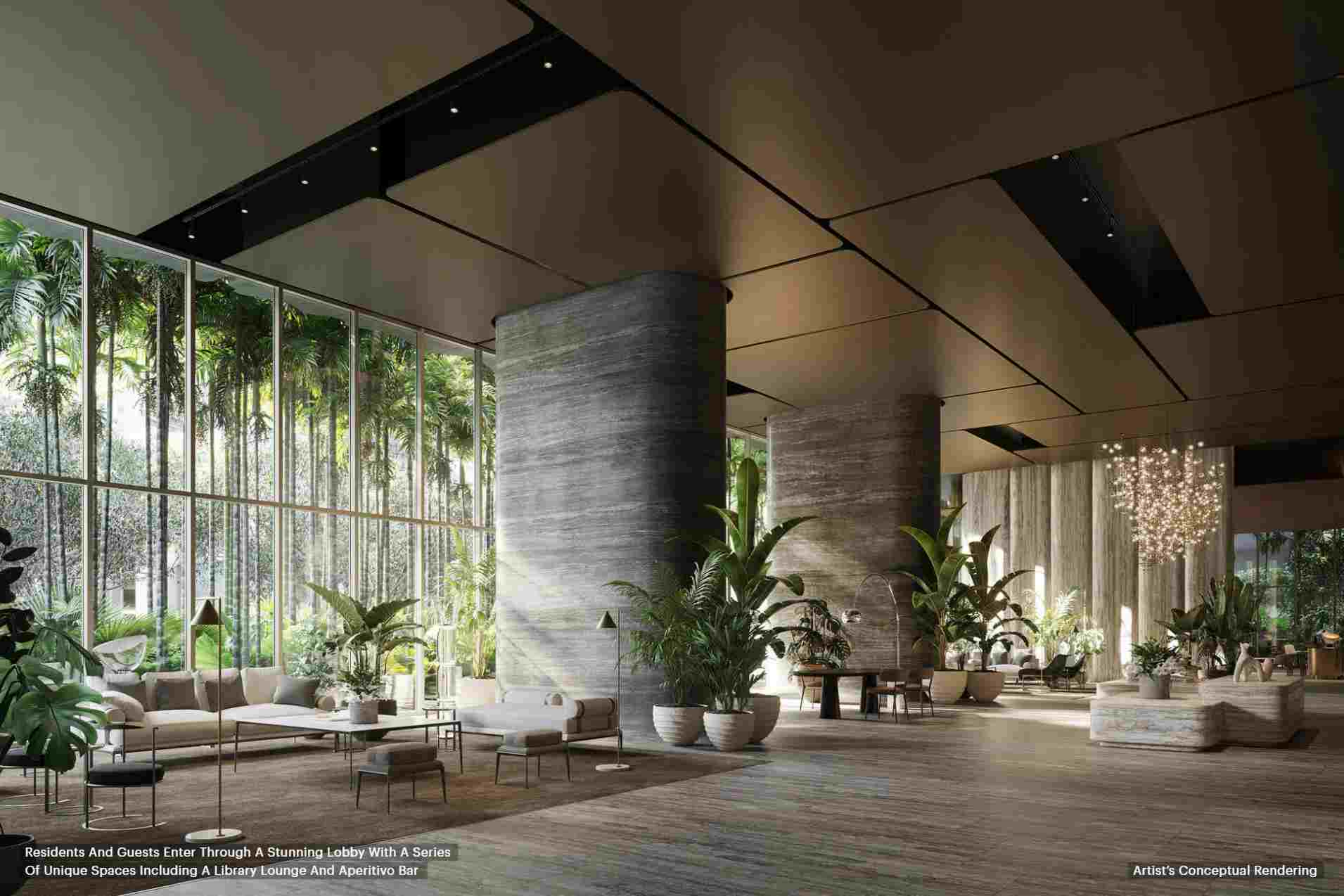
Residents And Guests Enter Through A Stunning Lobby With A Series Of Unique Spaces Including A Library Lounge And Aperitivo Bar