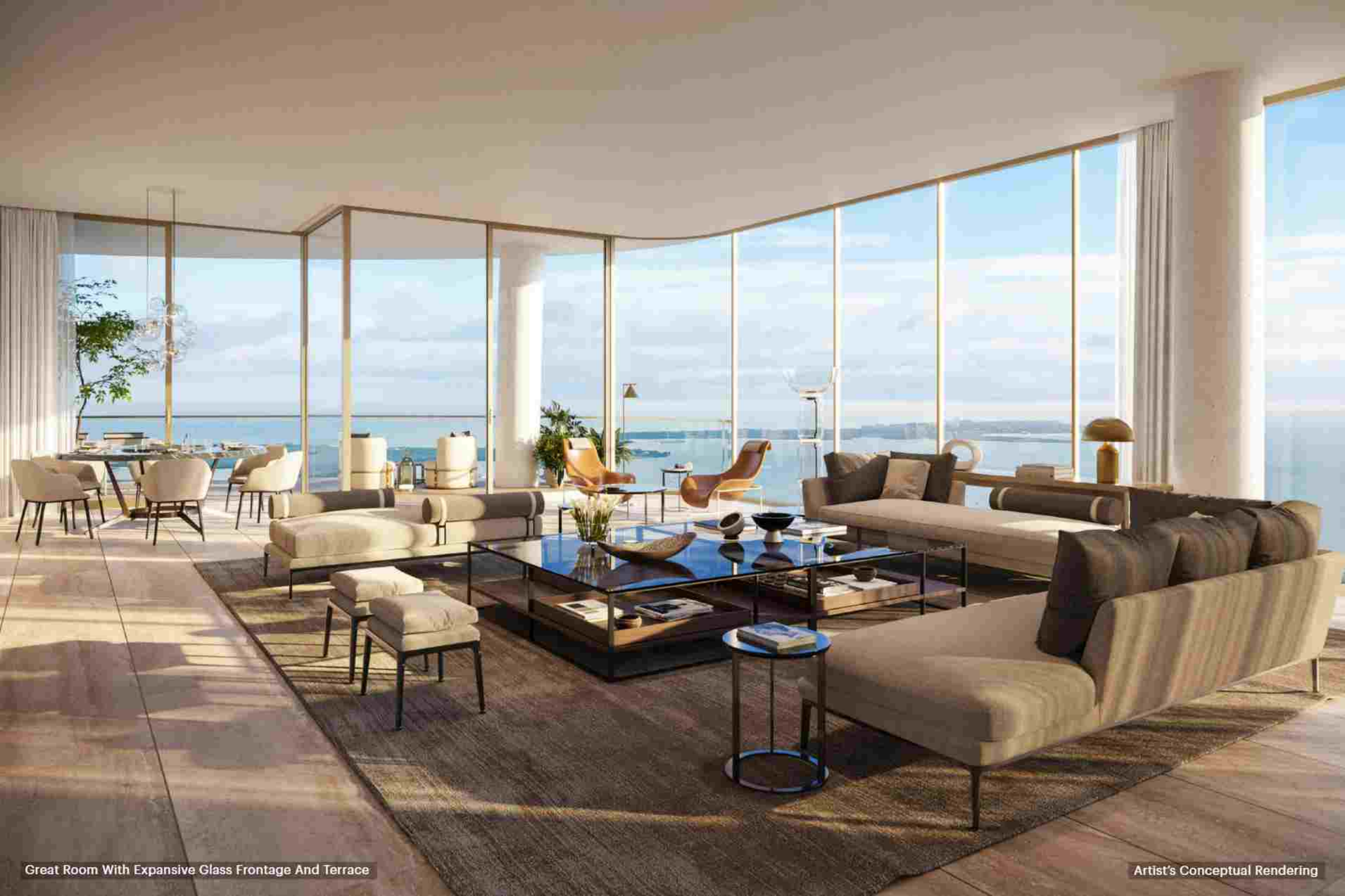
Great Room With Expansive Glass Frontage And Terrace