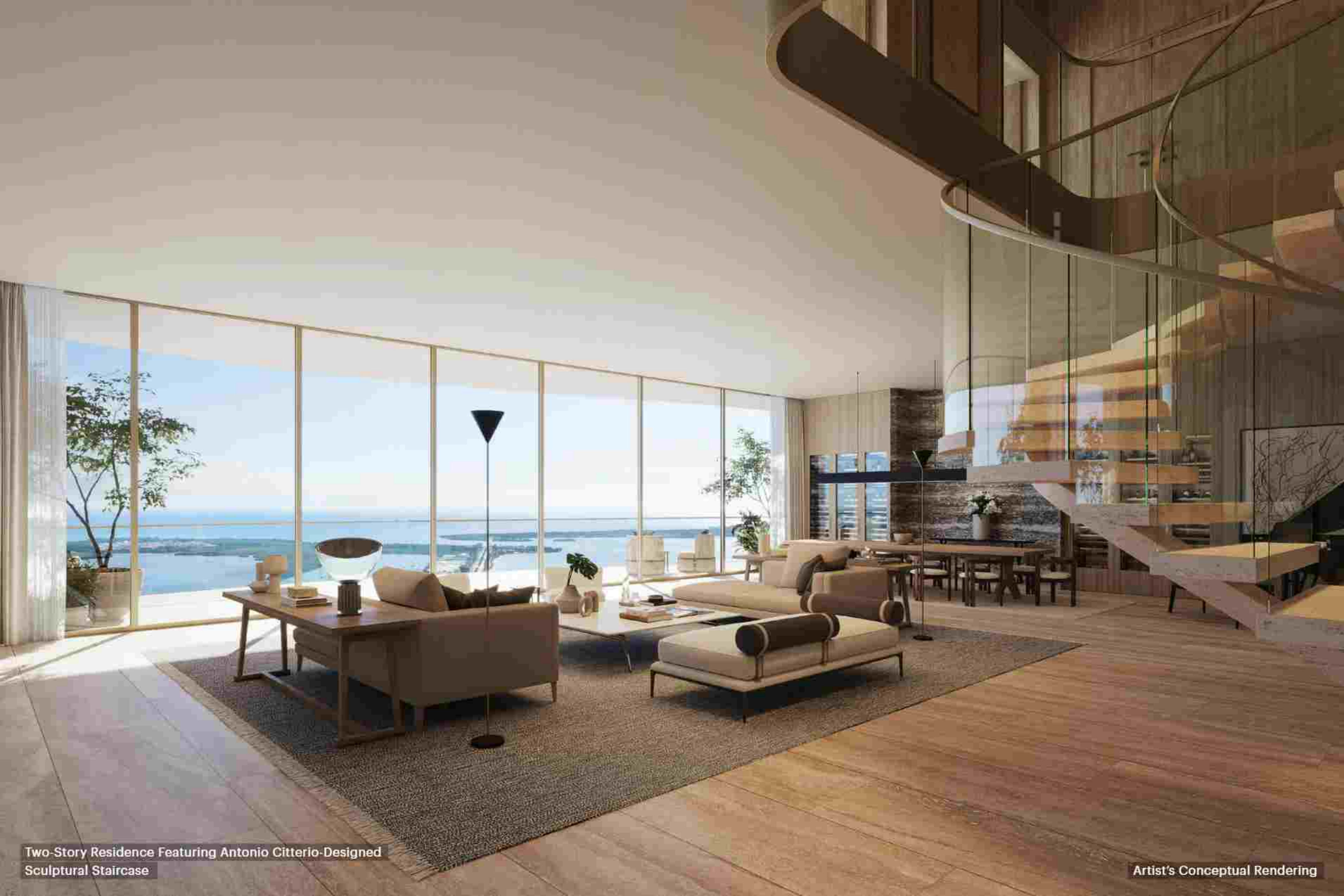
Two-Story Residence Featuring Antonio Citterio-Designed Sculptural Staircase