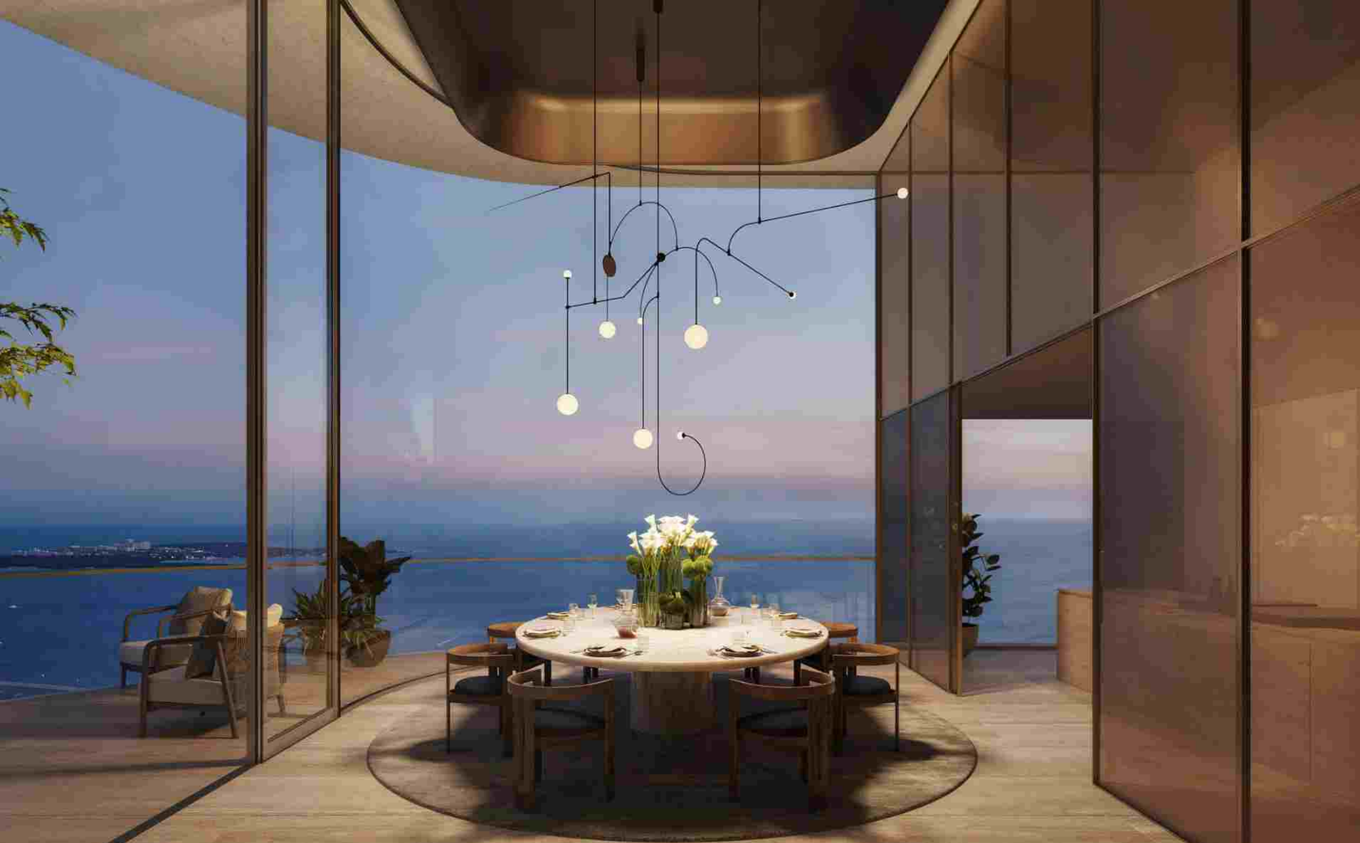
Private dining room with stunning, limited edition Vaselli chef's kitchen for intimate gatherings and special occasions